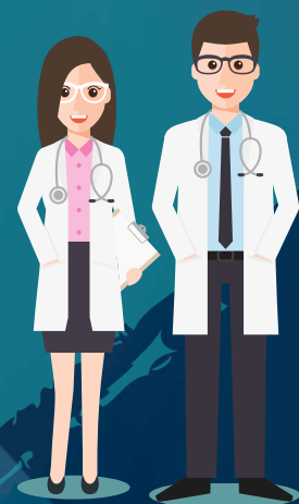
Communication with colleagues