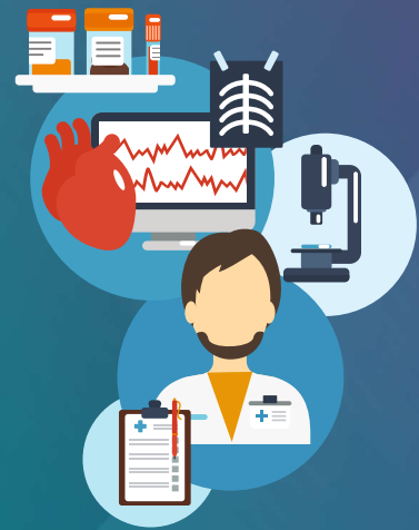
Applied clinical knowledge