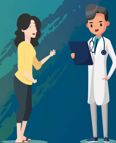
Communication with patients and families